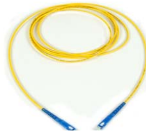
SM HLC assembly with serial number and bar code label.

Megladon Manufacturing Group, Ltd. 12317 Technology Blvd Suite 100 Austin, Tx 78727 800-232-4810 www.megladonmfg.com